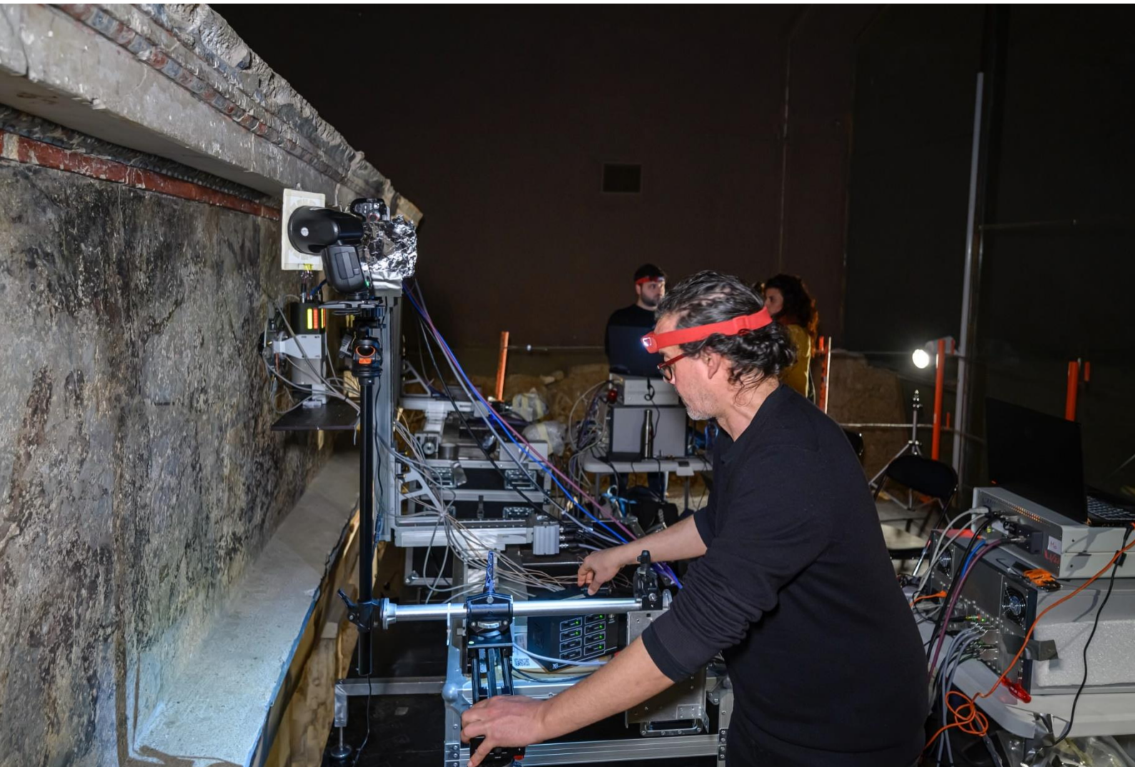
Image 3. Archaeological site of Aigai. Façade of the Tomb of Philip II. 3D photogrammetric registration of the wall-painting, performed by the team of XRAYlab, ISPC/CNR, Catania, March 2023.