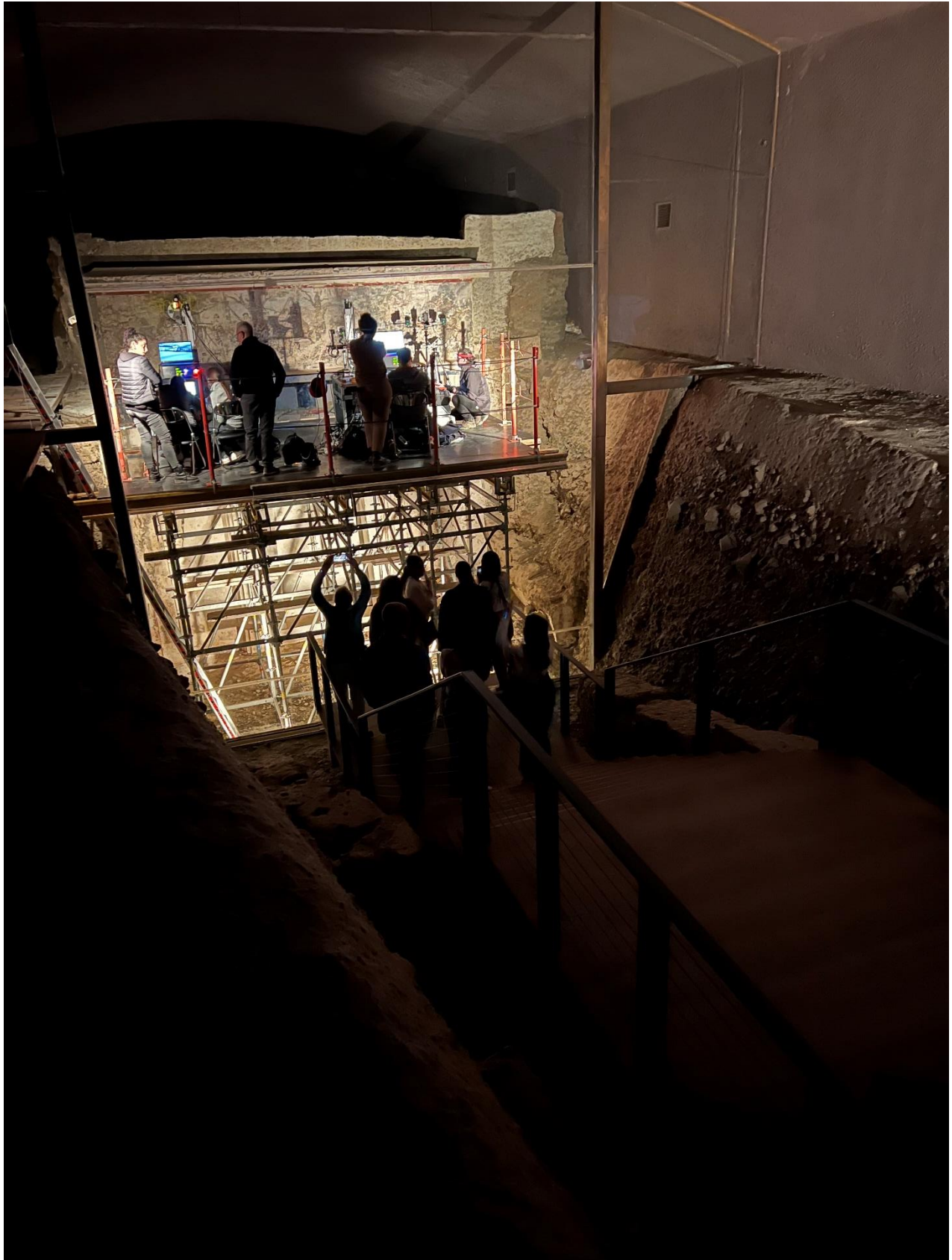
Image 1. Archaeological site of Aigai. Façade of the Tomb of Philip II. Scientific investigation of the wall-painting with non-destructive methods of analysis, performed by the collaborating laboratories of the ReVis project, March 2023.