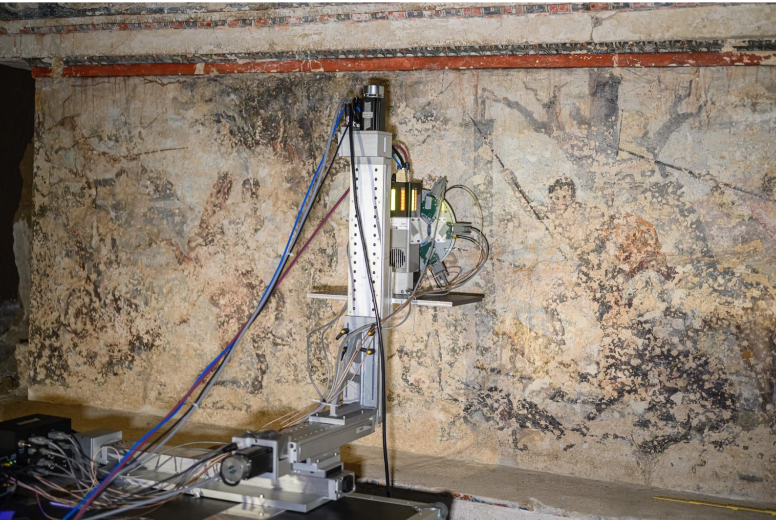
Image 4. Archaeological site of Aigai. Façade of the Tomb of Philip II. Elemental mapping of the pigments of the wall-painting with MAXRF, performed by the team of XRAYlab, ISPC/CNR, Catania, March 2023.